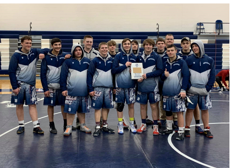
Congratulations to our Montabella Wrestling Mustang Duals Champions