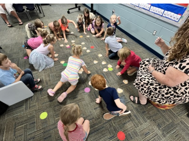
Learning Is Fun at Montabella