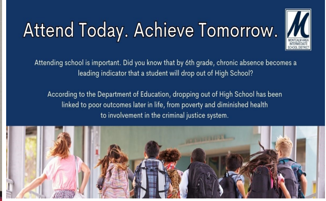
Be Responsible * Be Respectful * Be Safe